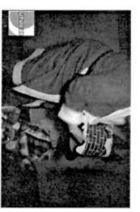
Dinner with many Santas