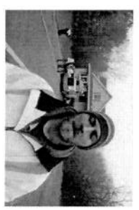
House moved near airport Dec 13, 2011